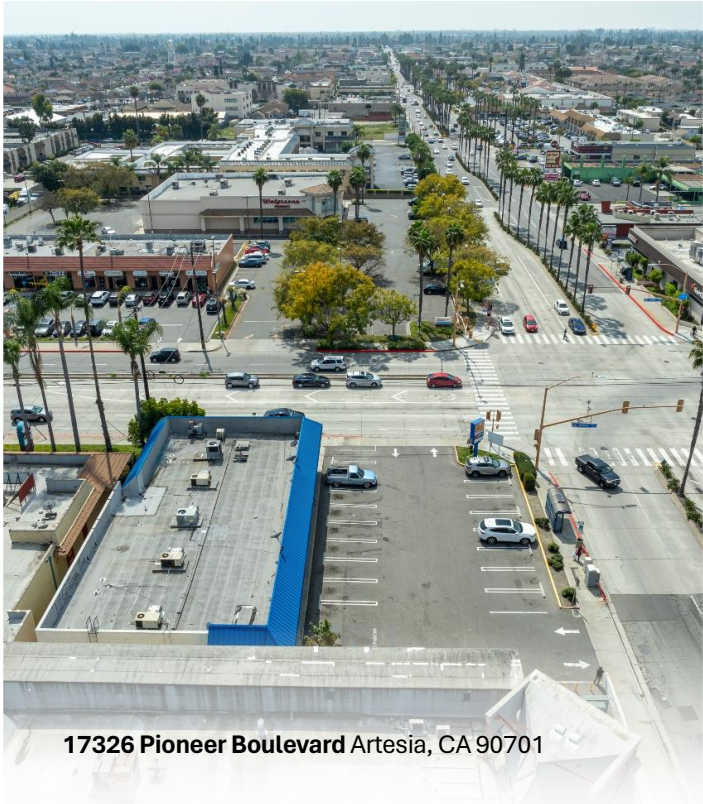
17326 Pioneer Boulevard Artesia, CA 90701